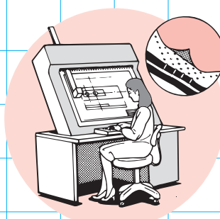
Drafter Sheet Suction