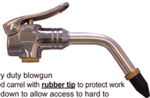
Heavy duty blowgun Angled barrel with rubber tip to protect work Bent down to allow access to hard to reach areas