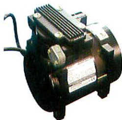
Single Head PTFE Coated Model