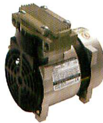
Single Head Normal Model