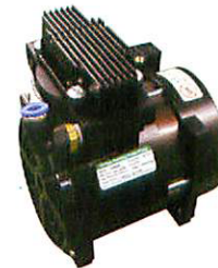
Single Head BLDC