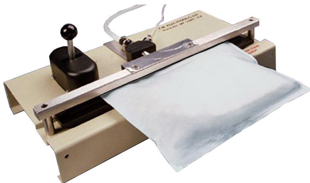
TS-01 12" Open Package Fixture