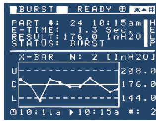
Ongoing test data are shown on a statistical control chart for tighter process control.