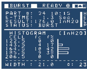
Accumulating test data are shown in histogram form to give a visual overview of your process.