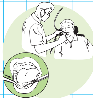
Saline Water Splasher