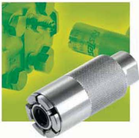
For External Threads