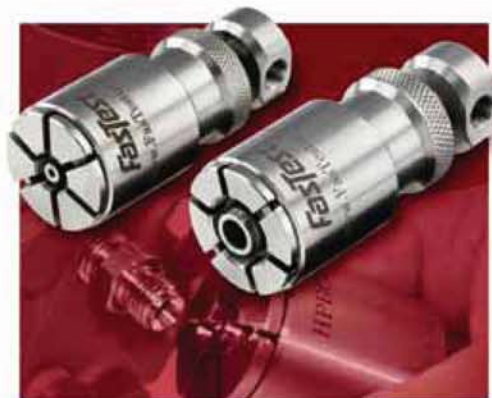
For External Threads