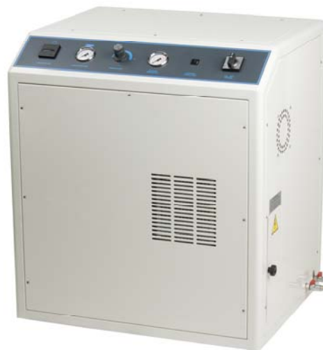
Output Air Flow