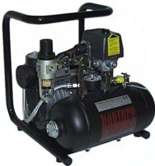
Output Air Flow