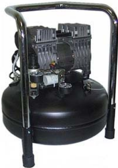
Output Air Flow