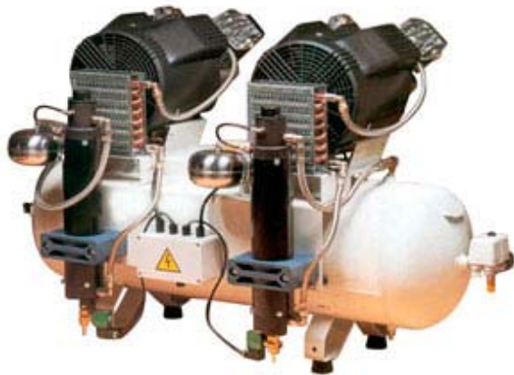
Output Air Flow x2