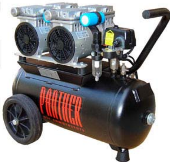
Output Air Flow x2