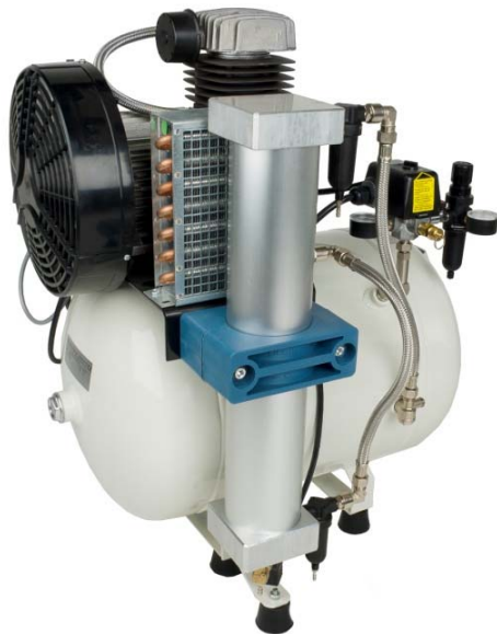
Output Air Flow