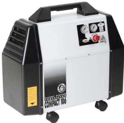
Output Air Flow