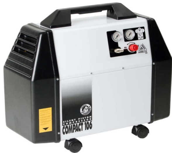
- INTEGRATED OIL FREE AIR COMPRESSOR PACKAGE